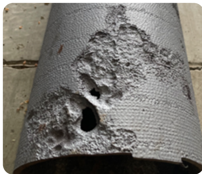
Validation of KenWave's DRI solution showing at location 1 distress on a section of ductile iron pipe.

The project not only provided the City with essential data to prioritize maintenance and replacement efforts but also underscored the potential for integrating advanced diagnostic technologies with traditional civil infrastructure projects. This case study exemplifies how innovative technology can significantly enhance the management and longevity of critical public utilities.