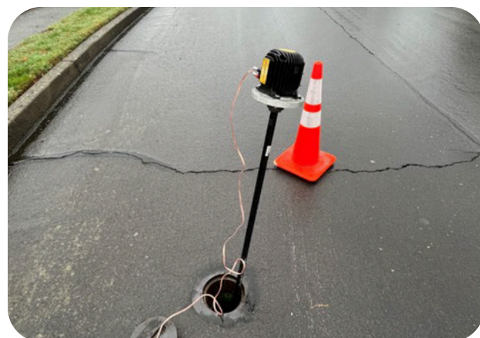
KenWave's DRI system in action: a wave generator introduces vibroacoustic signals into the pipeline to assess structural integrity—all without excavation. Photo taken during the Gresham, OR pilot project.

DRI works by generating and analyzing acoustic waves within the pipeline, identifying variations in material properties and detecting flaws or degradations. The technology's capability to provide a structural thickness profile with high resolution (6 feet) enabled efficient detection of degradation zones and structural inconsistencies. Even in areas with sparse access points, KenWave's DRI technology effectively extended its inspection capability up to 887 feet, demonstrating potential for reaching lengths up to 1,500 feet.